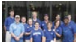
City Hall Cooking Team.