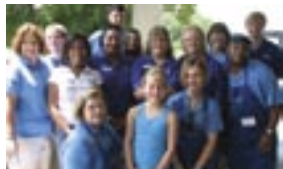
Even the kids came out to Raleigh.