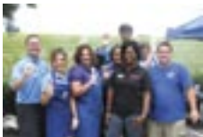
Whitten cooking team.

The City of Memphis Credit Union launched a membership appreciation drive during the Summer of 2009. We were honored to cook lunch for members at each of our six branches, City Hall, Memphis Fire Academy, Memphis Police Academy and for the City of Memphis retirees.