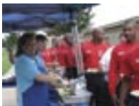
A treat for the MFD recruits.