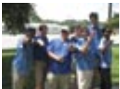
Yes, 2009 was a very good year!