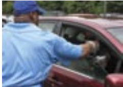
Curbside service at Mt. Moriah.