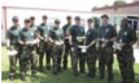
Green MPD recruits.