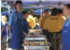
Yellow MPD recruits.