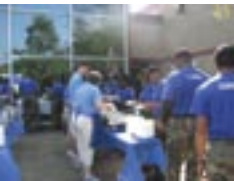
Blue MPD recruits.