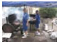
The cooks working for City Hall.